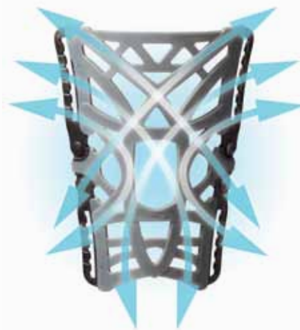
Fig 2 - The flexible membranes elongate and recede with joint motion